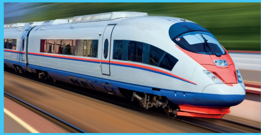
Fig.1 Terminal Blocks